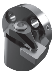
DCLN 85° AVH