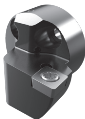
SCLC 85° AVH