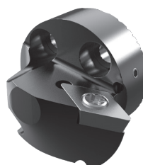
SDNC 62°30' AVH