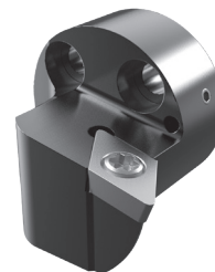
SDUC 87° AVH