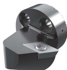
SDXC 93° AVH