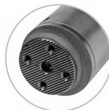
Ø50 to 60mm