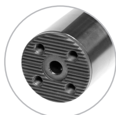
Ø16 to 40mm