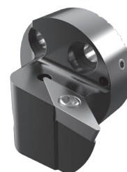
SVUB 87° AVH